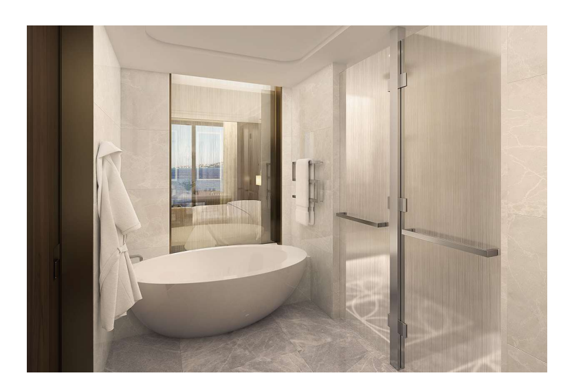
Mandarin Oriental Bosphorous, Istanbul (continued)