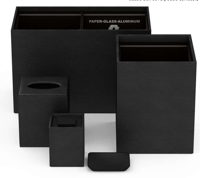
Black Sand Reis soap dish

Black Wave Textured Leather Match (cube recycling bin, cube storage bin, tissue box cover, cube canister)